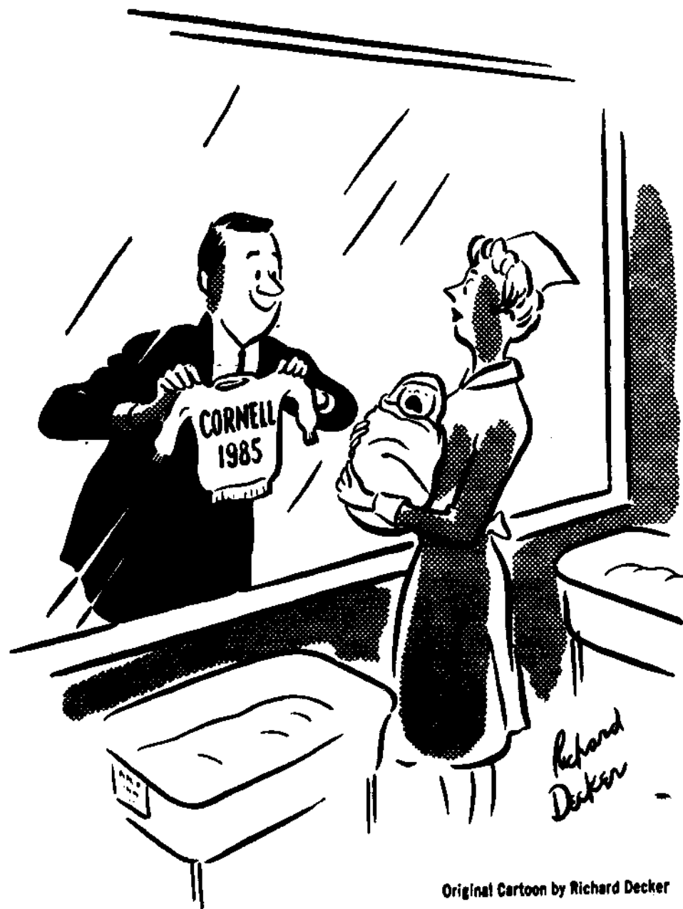
Original Cartoon by Richard Decker

At Con Edison, we also plan ahead... it's our job to anticipate the ever-growing power needs of New York and Westchester. It's one of the many ways we work to keep the cost of electricity down.